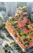
watch stefano boeri and sou fujimoto in discussion of 'architects, not architects'