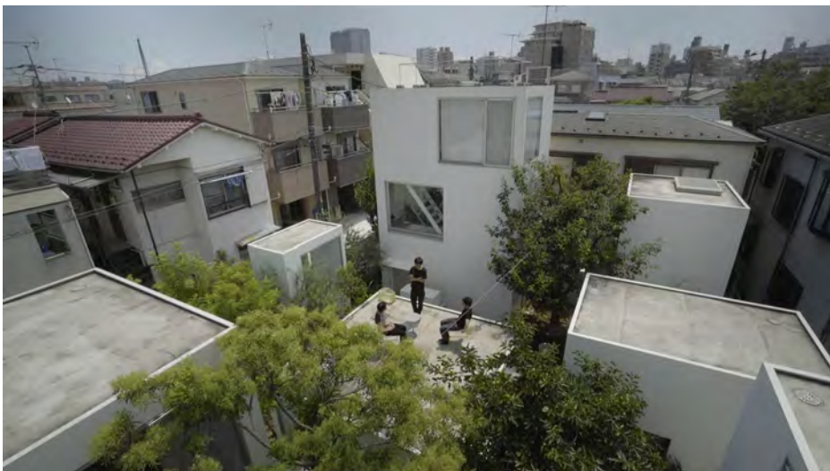
Moriyama-San , Bêka & Lemoine

The evenings of free screenings are curated by the duo Beka & Lemoine . In program also: Koolhaas HouseLife , Barbicania e The Infinite Happiness .